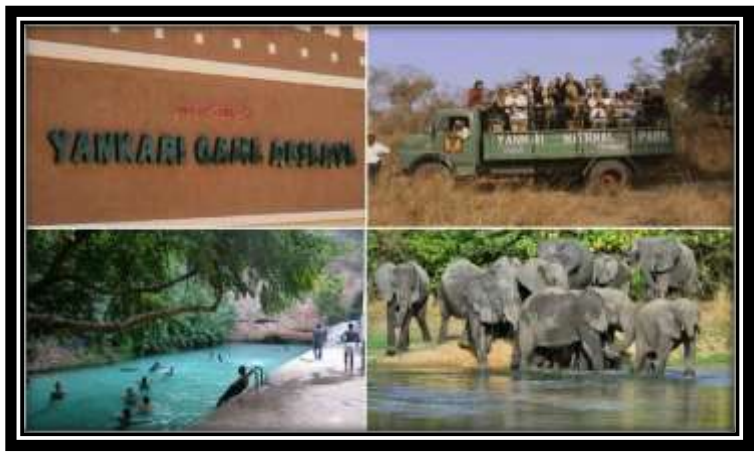
Our Culture, our Values